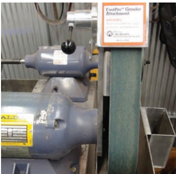
A zirconia belt with material loading present.

below show the proper use of the rubber belt cleaning stick to save you time and money. ■