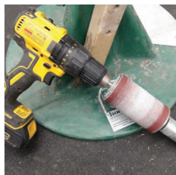
A hoof buffer sleeve loaded with hoof material.