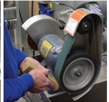
Turn on grinder. Maintain contact with belt and sweep side-to-side to clean.