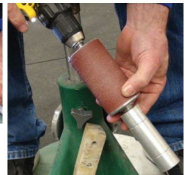
A clean hoof buffer.