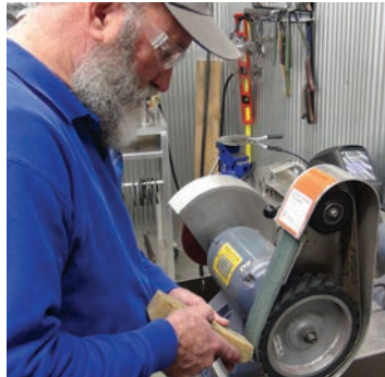
To clean belt, place rubber cleaning stick on belt at a 45° angle.