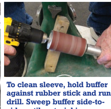
To clean sleeve, hold buffer against rubber stick and run drill. Sweep buffer side-to-side until material is removed. Be sure to set drill direction to ensure rotation is throwing material down and not up.