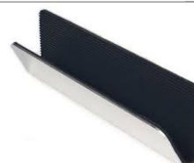
PORTE RÂPE ALUM.