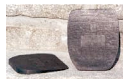
Full Wedge U.