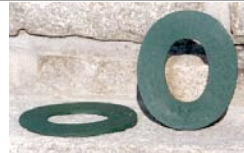
#12 2 Degré Oval