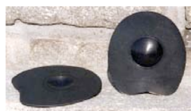
Pad à neige