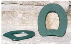
Small Bar #1